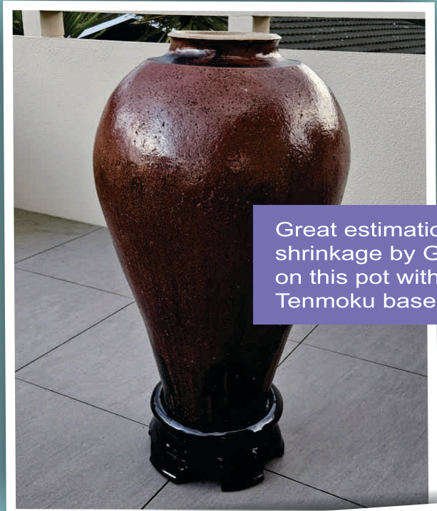
Great estimation of shrinkage by Graham on this pot with black Tenmoku base