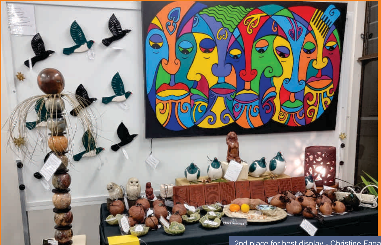
2nd place for best display - Christine Fagan